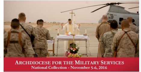
ARCHDIOCESE FOR THE MILITARY SERVICES National Collection - November 5-6, 2016

Next weekend our parish will take up the Collection for the Archdiocese for the Military Services, USA